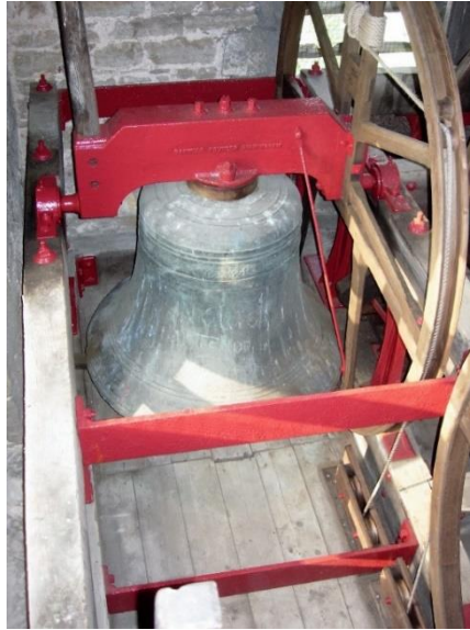
The spacious tenor pit

a bellrope taking the strain and the tenor bell start to 'dance excitedly' to the 'welly' being applied below. Not knowing if more bells were to be rung I hastily removed myself from the bell chamber and made my way downstairs.