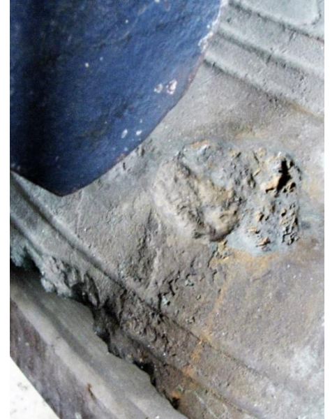
(The clock hammer indentation on the tenor bell)

During the work the opportunity was taken to turn the tenor bell through 180 degrees to present a fresh surface for the clock hammer to strike against as the bell casting had become severely exfoliated over some 90 years.