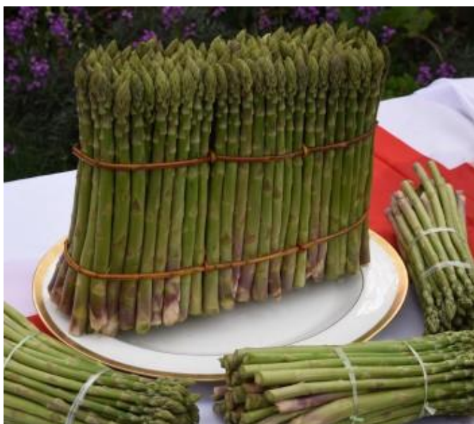
The 100 Round of the real stuff – 'Asum Gras'.