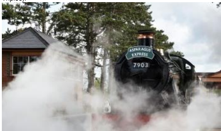
The Asparagus Express chuffs into Cheltenham non-stop from Broadway